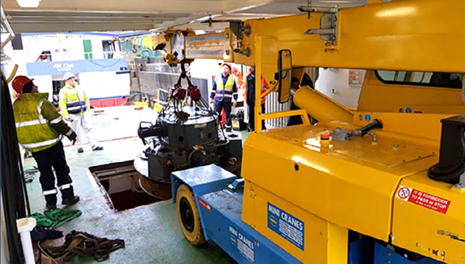
Articulated rear axle enables the Valla 120 to be manoeuvred into congested work areas.