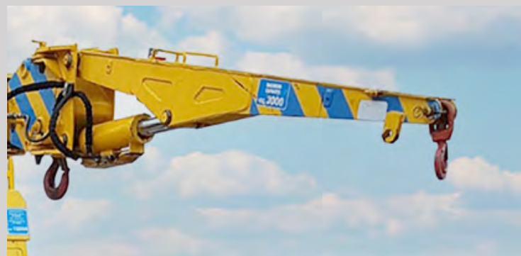
Fly jib (optional)