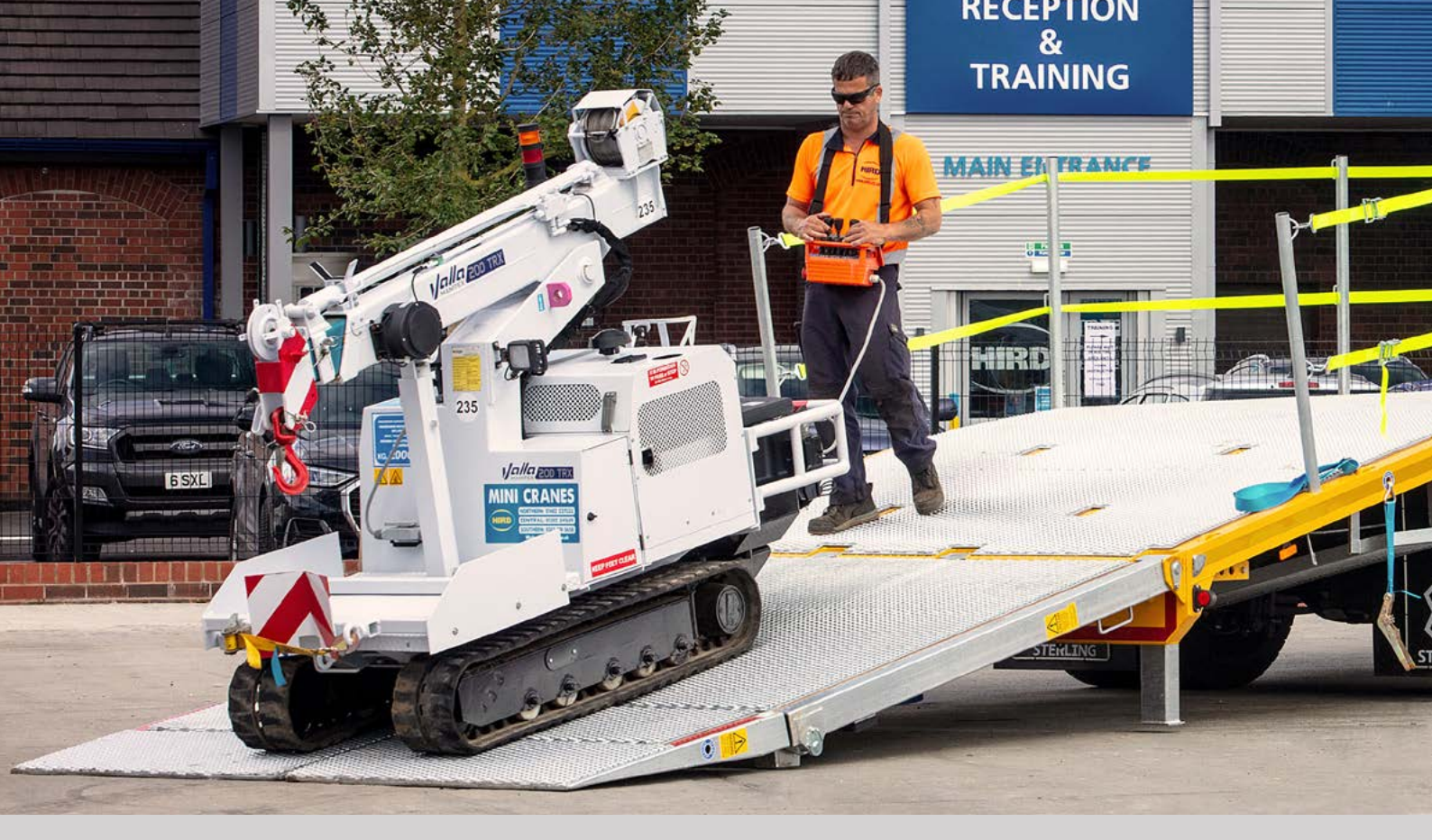
Tracks enable this crane be manoeuvred across busy, congested sites or on landscaped ground areas.