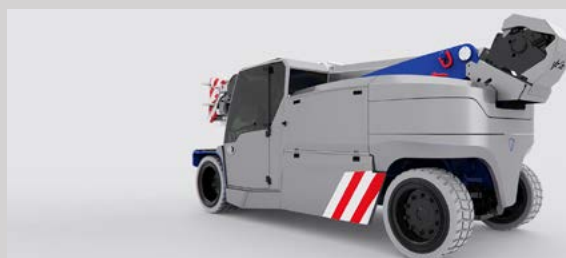
Hydraulic winch (optional)