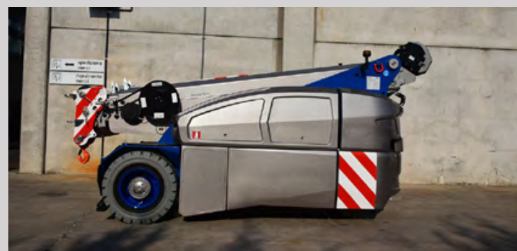
Fully remote controlled pick & carry crane